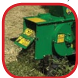
Discharge to ground