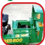
Hopper tilts back for easy access to rotor assembly