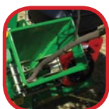
Chipper hopper with spring loaded guard assembly