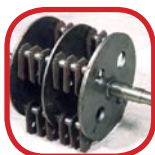
Heavy duty rotor assembly

available in trailer and four wheel models